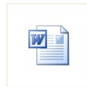
USB TO RS232 Cable for Wind...