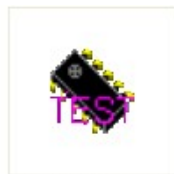
PL-2303H_HX_X simple tes...