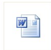
USB TO RS232 Cable for Wind...